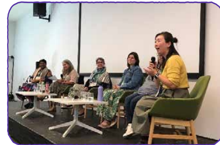
International State of Play Panel