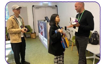
Delegates meet a keynote speaker