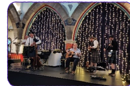
The ceilidh band