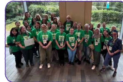
The conference "green t-shirt" volunteers

"It was very diverse and the presentations I was lucky enough to attend were very interesting. I feel I learned a lot, met lots of lovely people from around the world."