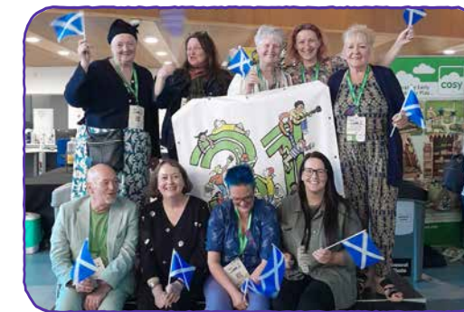
IPA Scotland Board

IPAGlasgow2023 inspired action! Commitments following the conference ranged from “dedicate one of our Masters courses to teach Designing for Children’s Right to Play”, to “start sitting on advisory boards to influence funding decisions”; from “continue pushing to have children’s voices reflected in decision making” to “pursue the adoption of the Convention on the Rights of Children in the US”.