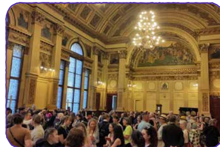
Welcome reception at Glasgow City Chambers