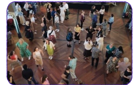
Ceilidh dancing in full swing