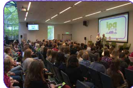
Delegates gather for the opening plenary