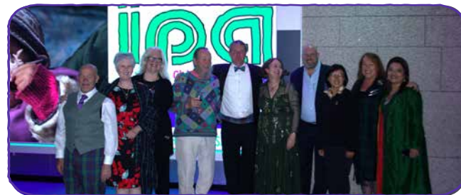
The Tartan Dinner

"My favourite part of the conference was the breaks that gave occasion to meet interesting people whilst enjoying a good coffee and sweet."