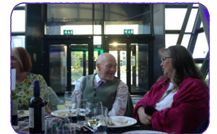
Tartan dinner conversations