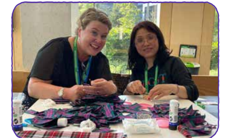
Preparing to welcome delegates

Feedback from the Glasgow Convention Bureau