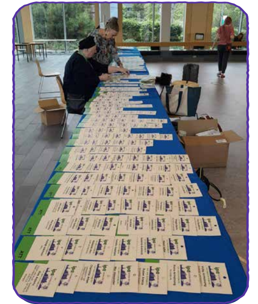
Tickets and lanyards in readiness for delegates

IPAGlasgow2023 inspired action! Commitments following the conference ranged from “dedicate one of our Masters courses to teach Designing for Children’s Right to Play”, to “start sitting on advisory boards to influence funding decisions”; from “continue pushing to have children’s voices reflected in decision making” to “pursue the adoption of the Convention on the Rights of Children in the US”.