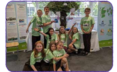
Children from St Mirin's Primary School