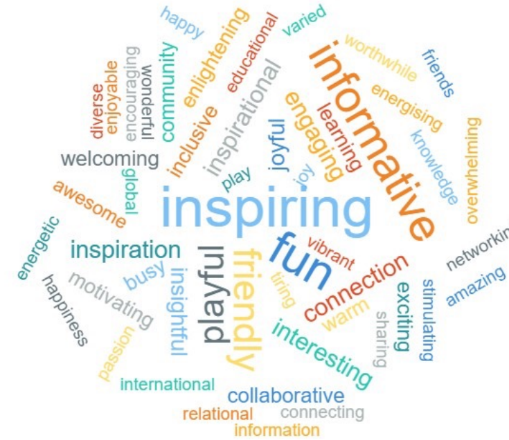
Delegates describe their conference experience