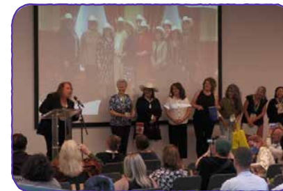
Pass the Baton ceremony