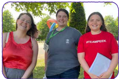
Young Reporters in action at Playday

"It's been the best day of my life so far, and it's only lunchtime!"