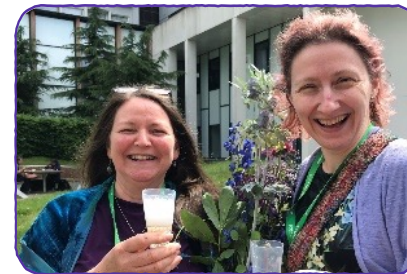
Fresh air and fizz

"It was deeply affirming to find people whose thinking and approach felt so important to me and should be to all those working in the field of mental health."