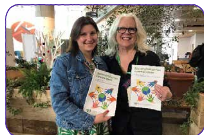
Ukrainian translation of IPA "Play in Crisis" guide