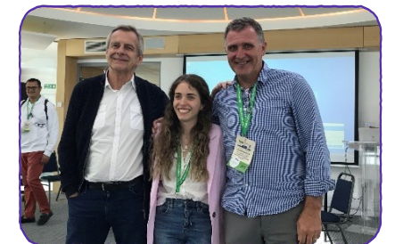
Thursday's "In conversation" panel